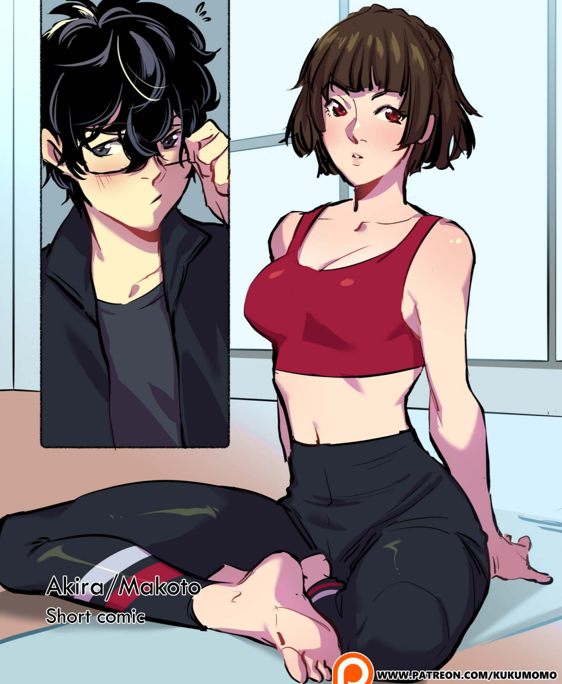
Akira/Makoto Short comic